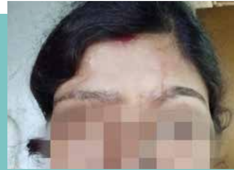
2 months after implantation