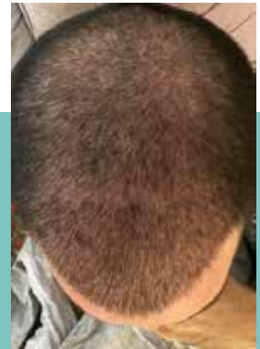
After 2 weeks