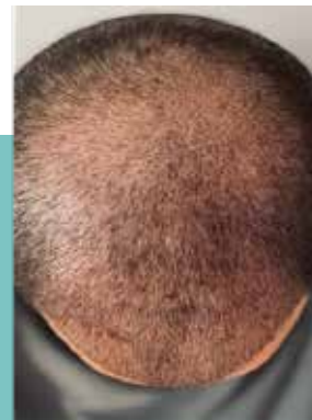
After 1 week