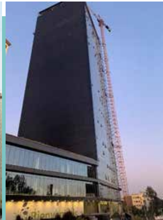
Actual site photograph, November 2019