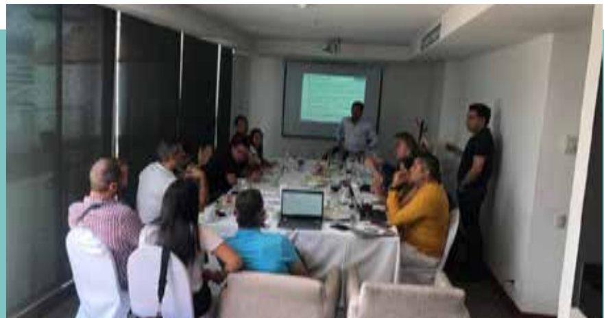
Business Training in Colombia for Franchisees