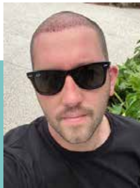
After 1 day